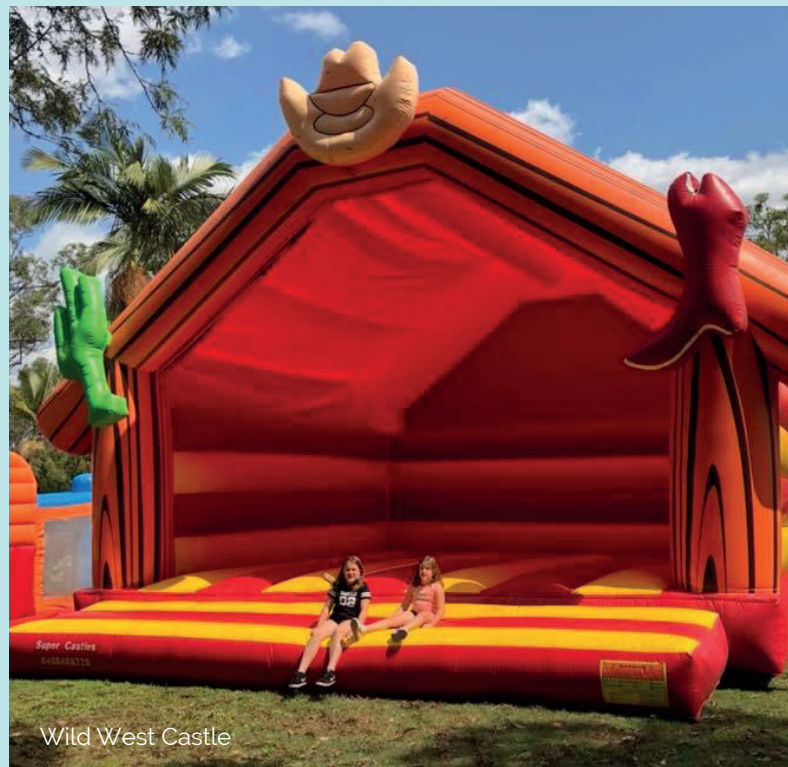
Wild West Castle

These Packages are Business opportunities; they also can be purchased as a franchise with legal documents for an additional $6000 to cover legal costs