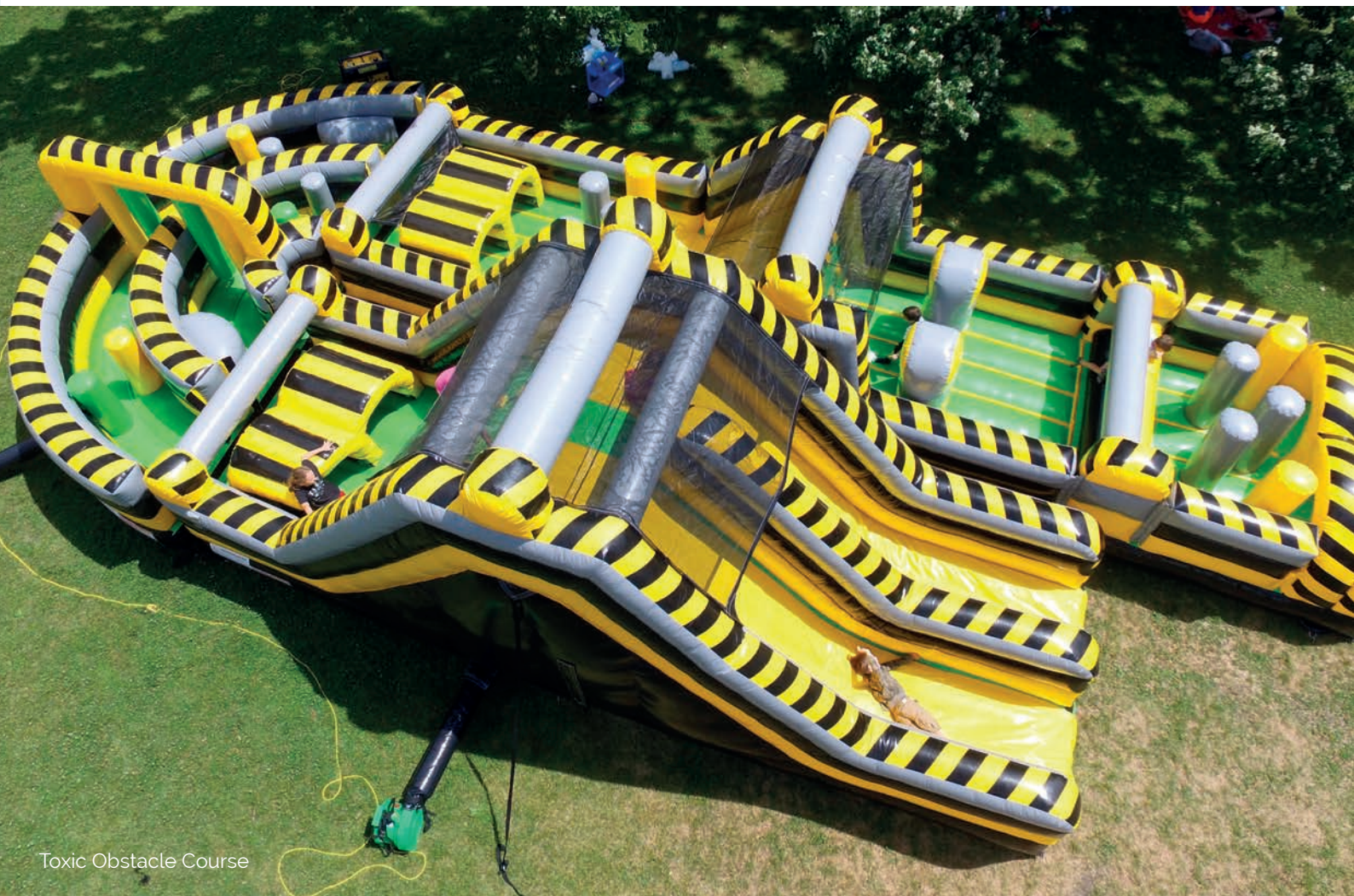
Toxic Obstacle Course