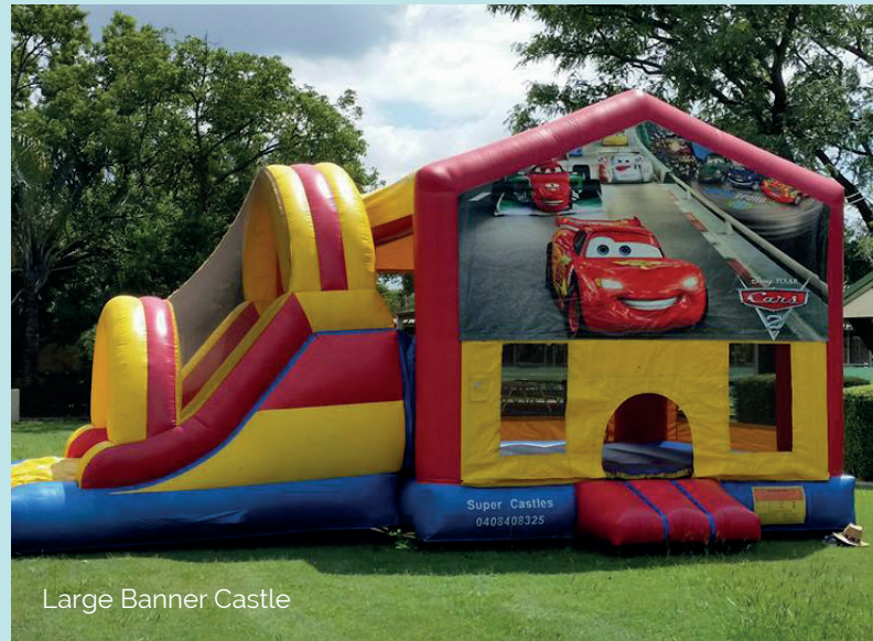
Large Banner Castle

2 Large Banner Castles 2 Small Banner Castles 40 Banners Train Obstacle Unicorn Fully Themed Castle Backyard Surfer Sign Written 8x5 Trailer 12 Blowers Sand Bag Covers Matting Pegs Trolley