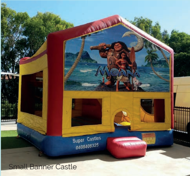
Small Banner Castle