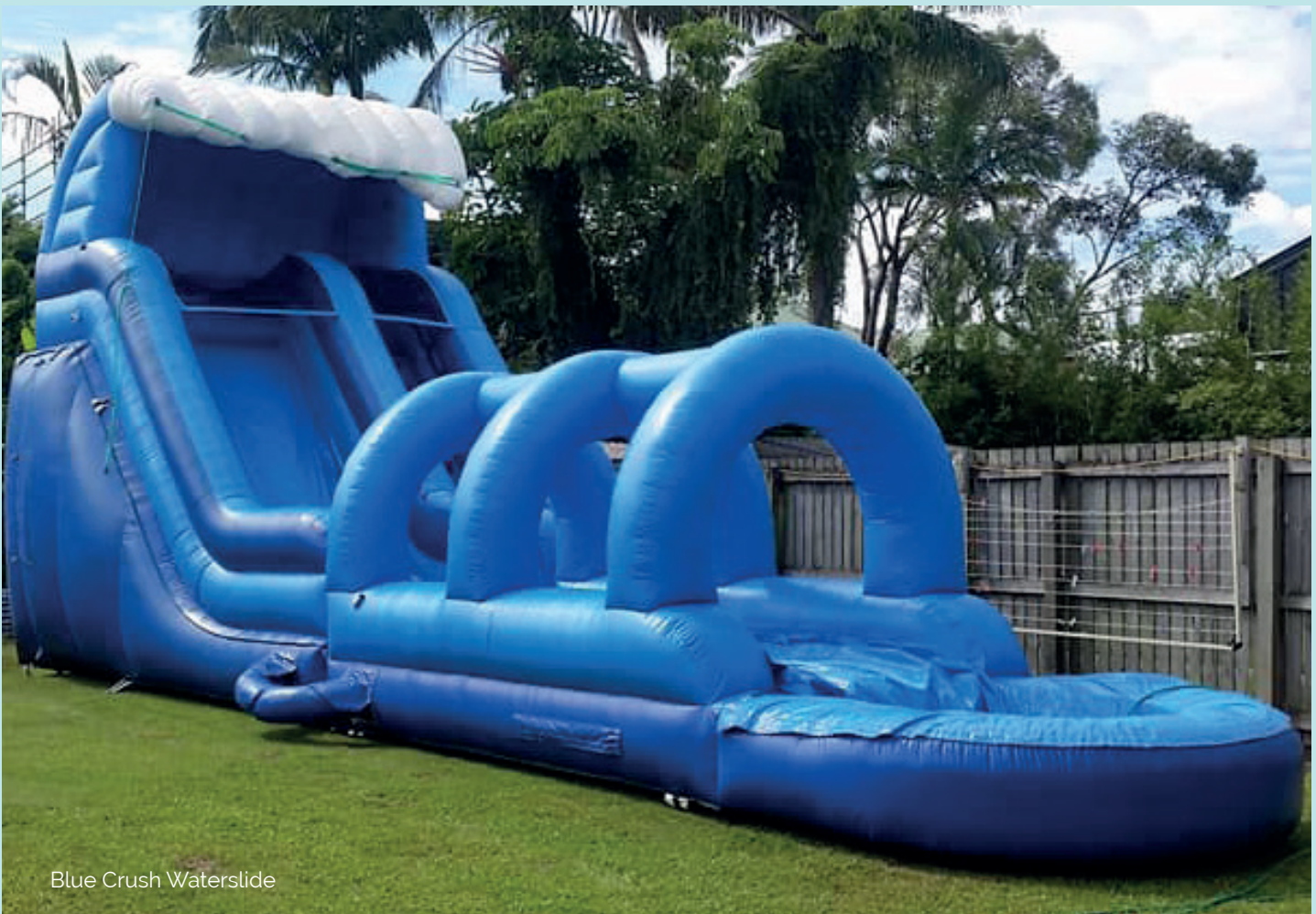
Blue Crush Waterslide

If all inflatable's are hired out for full day sessions on both the Saturday and Sunday your take home cash for the weekend is $2730 (can be higher if 2 half days of each castle are booked per day) your only weekly expense from this amount is fuel.